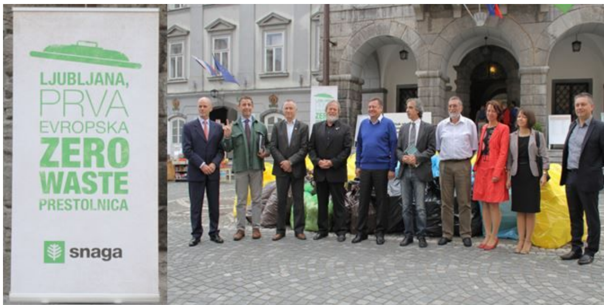
Ljubljana becoming the first Zero Waste city in Europe.

Ljubljana, along with 10 suburban municipalities, has the highest separate collection rate among capital cities of the European Union. The waste management company behind it is Snaga .